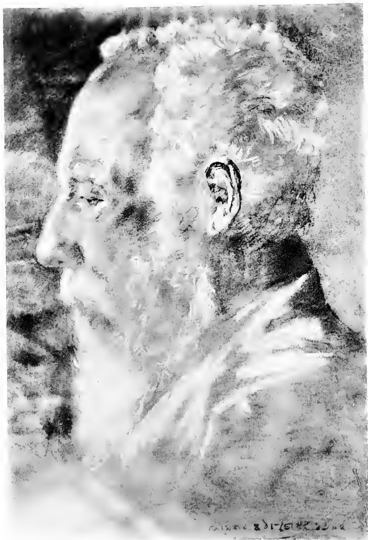
MAHARSHI DEVENDRANATH TAGORE. (AT 80 YEARS OF AGE)

Reproduced from a drawing by ARANINDRANATH TAGORE (1898.)